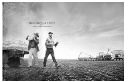
Happy Father's Day!